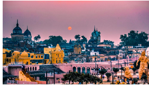
Famous For : Places To Visit Religious City

Widely known for being the place of birth of Lord Rama, Ayodhya is a city of immense religious and historical significance. Even though the Babri Masjid controversy brought it under the media light, Ayodhya still promises a feel of the rustic Indian life, with all its temples and simple people.